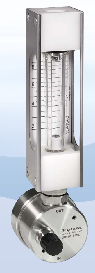
Model 2914 equipped with model VL flow meter

KYTOLA® Model 2914 Constant Flow Regulator is a sturdy, industrial constant flow regulator. It is designed to provide constant flow of medium volume liquid flows in applications where supply or back pressure varies.