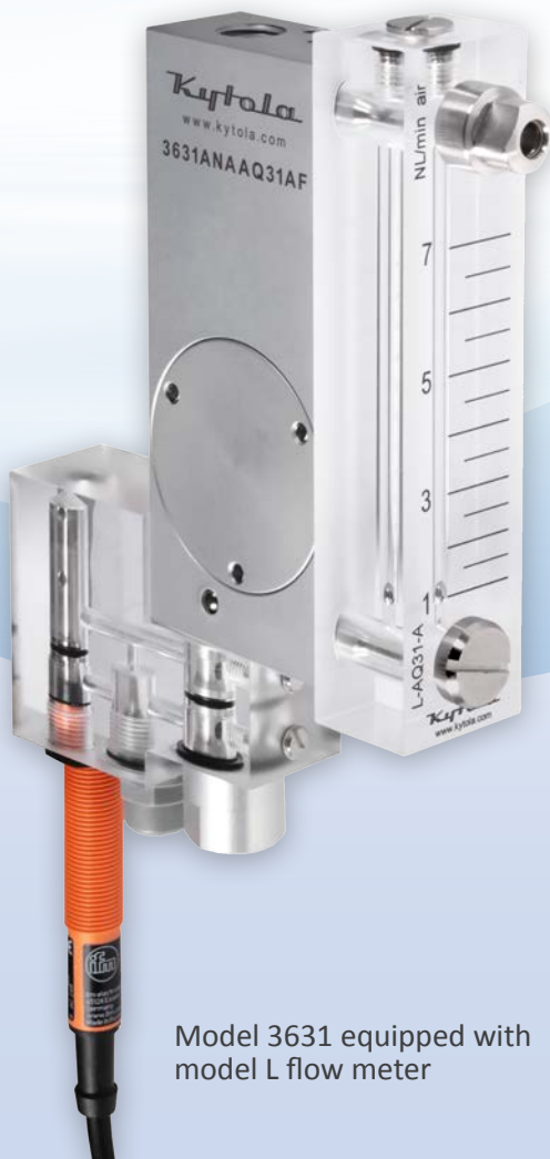
Model 3631 equipped with model L flow meter

The Kytola® Constant Flow Regulator Model 3631 is designed to provide a constant flow of liquids in applications where supply or backpressure varies. It also provides a constant flow of gases in applications where backpressure varies.