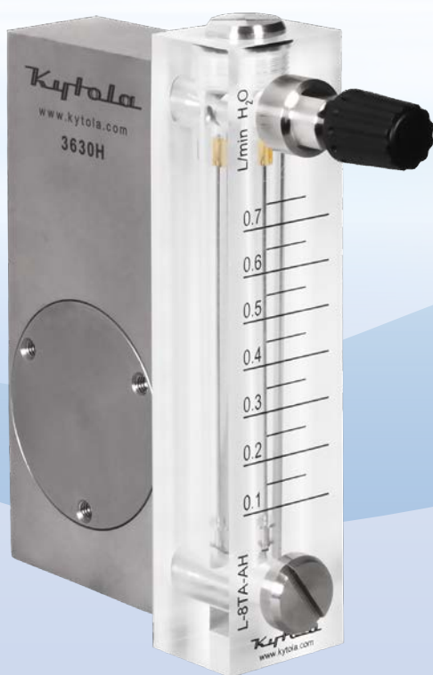
Model 3630 equipped with model L flow meter

It is designed to provide a constant flow of liquids in applications where supply or backpressure varies and to provide a constant flow of gases in applications where backpressure varies.